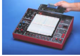
Reserve Fixed Holders It's available for universal connectors.